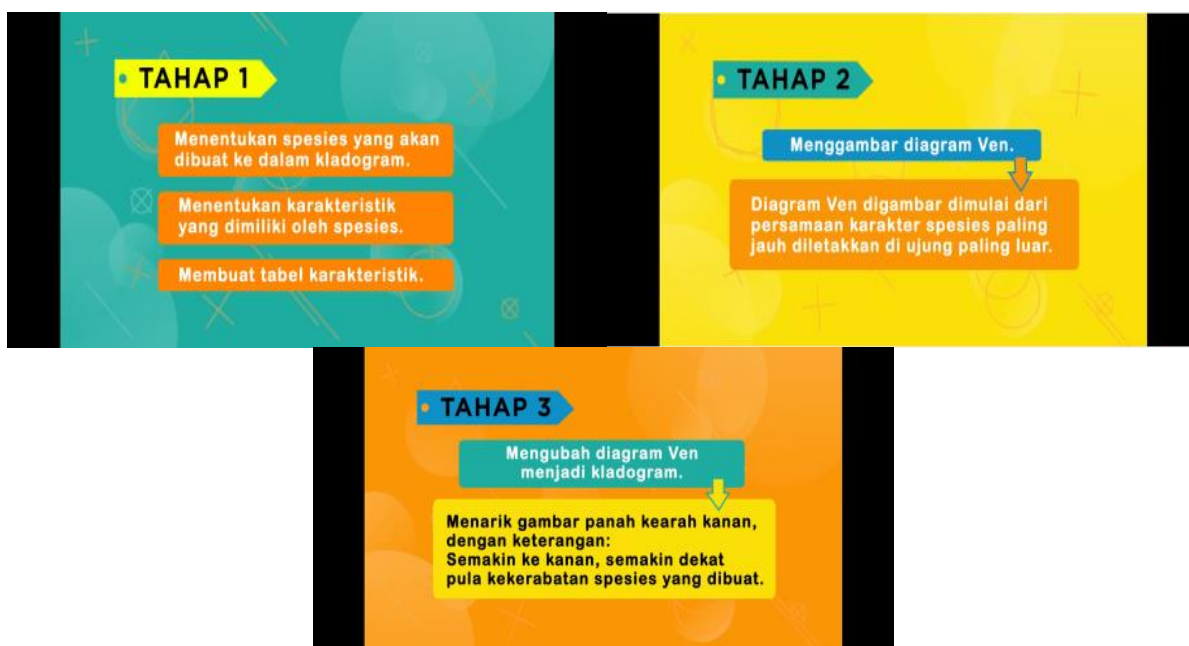
Figure 3 Steps to creating cladogram on media developed using Indonesian