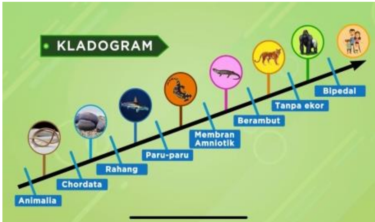
Figure 4 Sample of cladogram using Indonesian

converting a Venn diagram into a cladogram with an arrow shape (Figure 3). According to Taurista (2018), cladograms can be arranged in 3 stages: determining the species, making a Venn diagram, and converting the Venn diagram into a cladogram. In addition to providing examples of cladogram preparation, the motion graphic animation video also contains examples of the results of cladogram preparation, as presented in Figure 4.