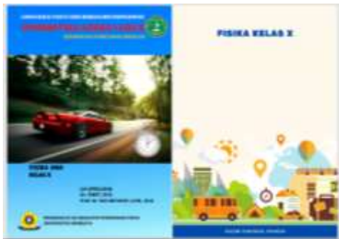
Figure 2 Cover of multi-representation-based electronic student worksheet before being displayed in a development application

Initial screen (Figure 3a) when opening multi-representation-based electronic student worksheet in the publou flupbook maker application. The following is a cover display (Figure 3b) of the multi-representation-based electronic student worksheet after it is entered in the publou flupbook maker application. The cover display (Figure 3c), after being developed in the publou flupbook application, displays the front cover with a background that matches the front cover. In addition to the cover of the multi-representation-based electronic student worksheet, it is also equipped with an inner cover section to emphasize the illustration of the material presented in it. On the side, there is an introduction to explain the benefits and uses of this electronic student worksheet. The next display is a table of contents sheet and basic competency sheets and indicators of competency achievement on the material of linear motion kinematics in multi-representation-based electronic