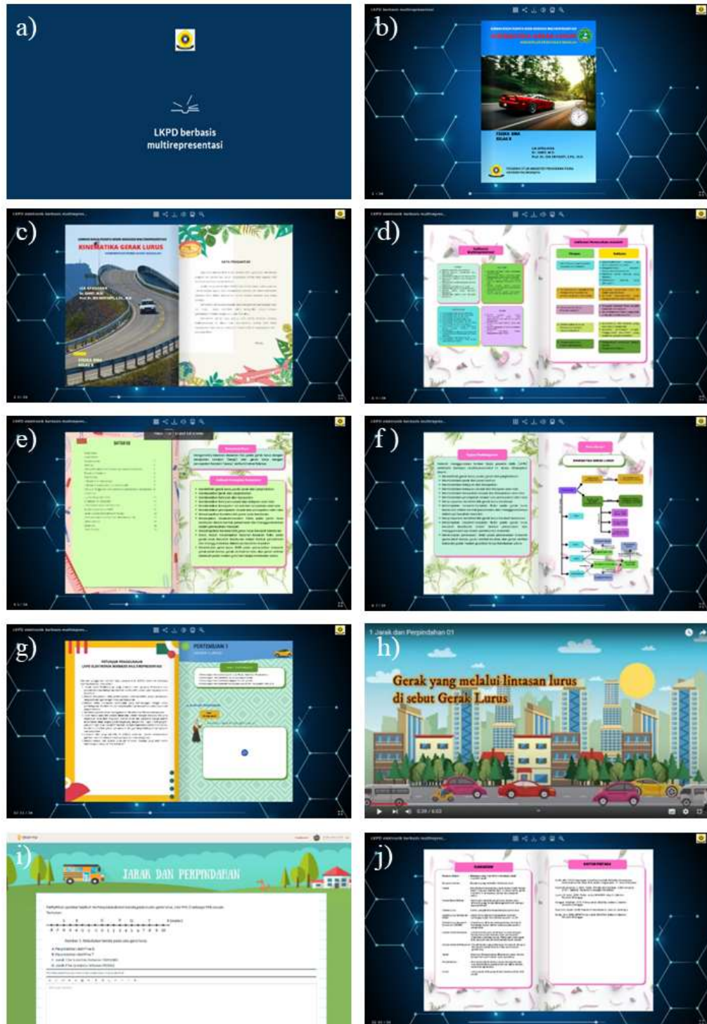
Figure 3 Display of multi-representation-based electronic student worksheet on the publup flupbook maker application. (a) Beginning, (b) Cover, (c) Inner cover, (d) table of contents, basic competency sheets and indicators of competency achievement, (e) learning objectives and material maps, (f) Multi-representation indicator sheets and problem-solving, (g) Instructions for use, (h) Learning videos, (i), the wizer.me application at the bottom of the questions and (j) Glosarium and bibliography.