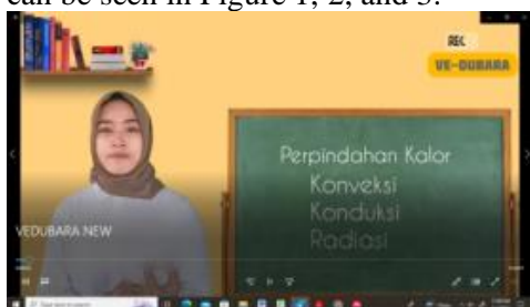
Figure 1 The opening of an educational video based on local wisdom

area, precisely in the Jepara district. The local wisdom raised in the first educational video is the making of Monel Kriyan, the Torch War, and the Processing of Coffee Beans. Research was also carried out to improve critical thinking skills seen from a comparison of the pretest and posttest, an increase meaning that the media developed influenced improving students' thinking skills. The results of learning media in the form of educational videos seek to improve critical thinking skills on temperature and heat material by applying local wisdom activities, which can be seen in Figure 1, 2, and 3.