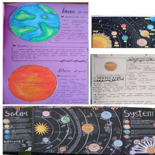
Figure 3 Student projects

observations, and studying literature in the form of clips as learning products. For students with an auditory learning style, the teacher gives tasks such as watching and listening to films and then analyzing the findings in the form of podcasts as a product. The teacher provides role-playing activities to become planets in the solar system for students with a kinesthetic learning style and then interprets the results of observations in the form of solar system dioramas as product differentiation. Students are active in doing learning projects. Figure 3 depicts some of the results of student learning outcomes.