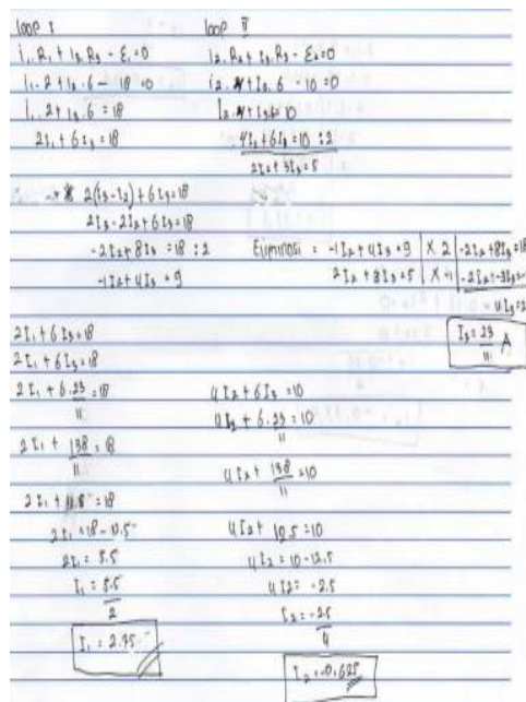
Figure 3 Using Mapping Mathematics to Meaning in Completing Problems

Moreover, in the fourth, fifth, and eighth test the students used mapping mathematics to meaning in completing the problem. In this game, the students calculated by writing down Kirchoff law at the beginning, labeling each loop, conducting substitution and elimination. The example of problem-solving was completed by moderate physics-capable students to use mapping mathematics to meaning was presented in Figure 3.