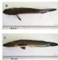
Figure 1. Haruan Fish.

negatively charged amino acid molecules that form proteins in bacteria which causes protein denaturation on the bacterial cell wall and results in bacterial cell death. 4,6,9,10