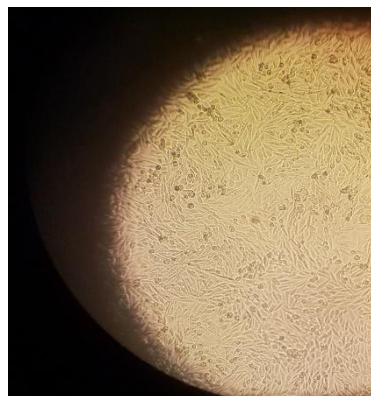
Figure 3. Fibroblast BHK-21 morphology 100x magnification on a 70% concentration.

MTT method has a principle that is the reduction of MTT tetrazolium yellow salt (3-(4,5-dimethylthiazol-2-yl)-2,5-diphenyltetrazolium bromide) by the reductase system. The mechanism of MTT starting from the yellow tetrazolium salt is reduced in cells that have metabolic activity. Living cells from mitochondria that play an important role are those that have dehydrogenase. If dehydrogenase is inactive due to toxic effects, formazan will not be formed which is according to enzymatic activity. The purple intensity is formed based on the number of living cells. 7,8 In this study, the highest intensity of purple was shown by extract concentration of 30%. This showed that fibroblast cells that live at a concentration of 30% was more than the other groups. Cells with the ability to maintain cell permeability are most likely because there is an active chemical compound in small white ginger extract that can stimulate proliferation of fibroblast cells. 5,6 Morphology of BHK-21 fibroblast cell welding which has been treated with small white ginger extract at a concentration of 70% using an inverted microscope with 100x magnification can be seen in Figure 3 .