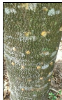
Figure 2. Acremonium sp. fungus grows around the injection hole, 3 days after inoculation

Three days after the inoculation process, around the injection hole and bamboo stick covered by Acremonium sp. (Figure 2), Acremonium sp. fungus could stayed for 5 to 7 days. Acremonium sp. fungus proved that cultivated agarwood by Lampung Bioserum inoculant produces agarwood was similar to natural agarwood. As stated by Wulandari (2009), Acremonium sp. is a fungus that can stimulate agarwood trees to create Terpenoid compounds as defense substances for agarwood trees that can produce aloes resin.