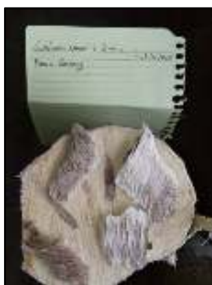
Figure 5. 3-month old Agarwood Chips, with inoculation distances of 10 cm and 15 cm