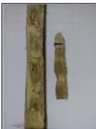
Figure 6. 3-month old Agarwood chips, with inoculation distance of 5 cm

The Chips of agarwood produced by Bioserum injection at distances of 5 cm, 10 cm, and 15 cm do not show different color and odor. The agarwood chips produced is light brown, and the smell of burned sap can be felt, although it is not so strong. At a distance of 5 cm, agarwood is not in the form of chips but the resin formed is fused into other chips in each injection hole (lengthen). At injection distances of 10 cm and 15 cm, the agarwood sap formed is in the form of chips weighing 1.3 g/chips to 1.8 g/chips. However, at both distances there is enough space between the injection holes.