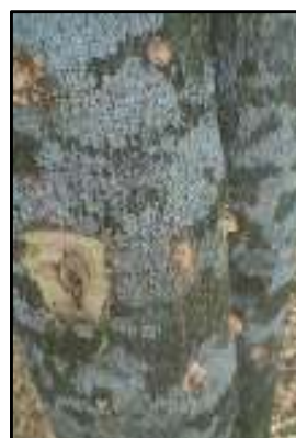
Figure 3. The discoloration of gaharu wood Aquilaria malaccensis 1 week after injection

A week after inoculation, the bark around the injection hole was skinned indicating the development of inoculation result. If the inoculation marks change its color into brown/black, it can be ascertained that the process of agarwood formation has occurred (Figure 3). The signs of agarwood formation are characterized by the changing color of the stem from yellowish white (pale) into brown and into blackish brown around the borehole (Winarsih, 2011).