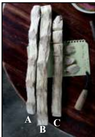
Figure 4. The Agarwood created after 3-months inoculation at a vertical distances of 5 cm, 10 cm, and 15 cm. (A) The shape of Agarwood with injection distance of 10 cm, (B) The agarwood with distance of 15 cm, and (C) The agarwood with a distance of 5 cm