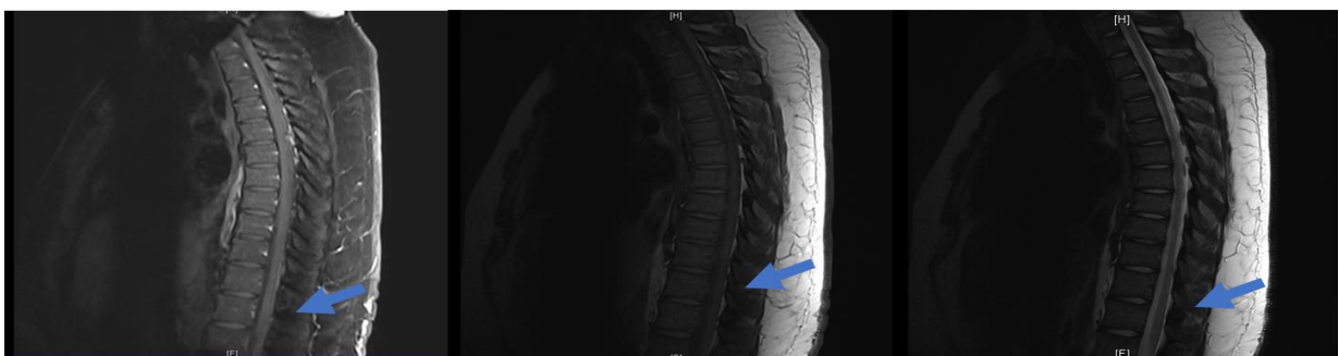
Figure 3. MRI Thoracic with contrast on thirteen day. It showed reduction in size of spinal epidural collection