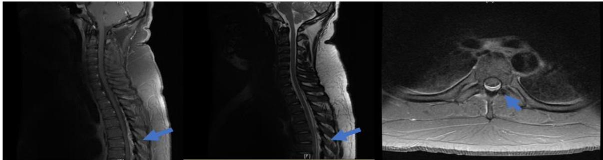
Figure 1. MRI sagittal,axial with contrast. It showed posterior epidural collection

This case report showed the comprehensive diagnostic tool to yield out the aetiology of thoracic epidural collection, despite negative result.