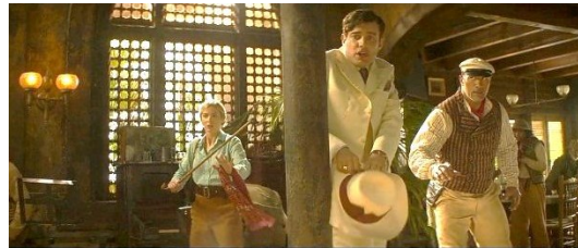
Image 3. they prepared themselves against the attacking tigers

In this scene, it tells the story of a situation where in a tourist restaurant, a tiger comes in and looks hungry as if looking for prey, which makes people panic and afraid. Framing medium range shot which clearly shows the room filled with three people with the staging set in this scene showing Dr. Lily is behind with her readiness to attack the tiger. Meanwhile her brother, McGrigor was at the front with a pole shield and was afraid. Dr. Lily dared to face the situation by saying "I am not afraid." by holding a simple weapon to prepare yourself against the tiger. Her courage was greater than her fear. She can control her fear by trying to calm down and preparing resistance. In this scene it is quite clearly shown that a woman can have the same courage as a man. Like Frank with his muscular body, preparing himself to attack the tiger.