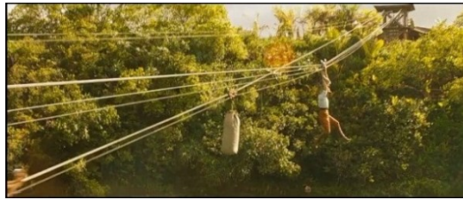
Image 5. Dr. Lily hanging to glide