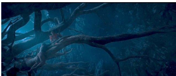
Image 7. Jumping from a branch at the height of a tree