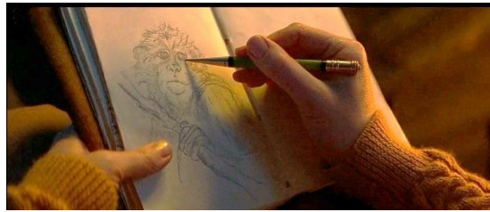
Image 1. Dr. Lily drew a monkey

In this scene, Dr. Lily's character analysis can be seen through external action as well as characterisation through other characters' reactions. Through external action, shown in the picture with a close-up shooting technique, framing full of animal drawing objects and also her hand drawing it, signifies her smart character because she has skills that may not be able to be done by others as well as she does. Her actions directly illustrate that Dr. Lily is an intelligent woman with her way of putting her imagination on paper. The drawing of the monkey is clearly seen with the help of shallow focus, with the edges of the image given a blur effect, while the focus to the centre of the image so that the audience pays attention to the direction of the camera focus to show clearly how the painting looks like and how the hand holding the pencil can explain the character of Dr. Lily.