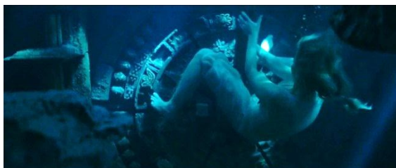
Image 6. Dr. Lily pull the lever in the river water room

This scene tells the story of the situation when they arrived at La Luna Rota, which is a river with a waterfall surrounded by rocks as the door to the location of the magic flower petals. As seen in the picture, by using medium shot framing, Dr. Lily, who was pulling the lever with her hands, was assisted by the strength of her legs. To make it clearer that the setting in this image is underwater, this scene uses deep focus to produce a clear and sharp image of how Dr. Lily loose hair is floating.