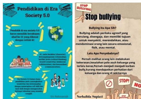
Figure 3. Training Participants Try to Make Posters Using Devices