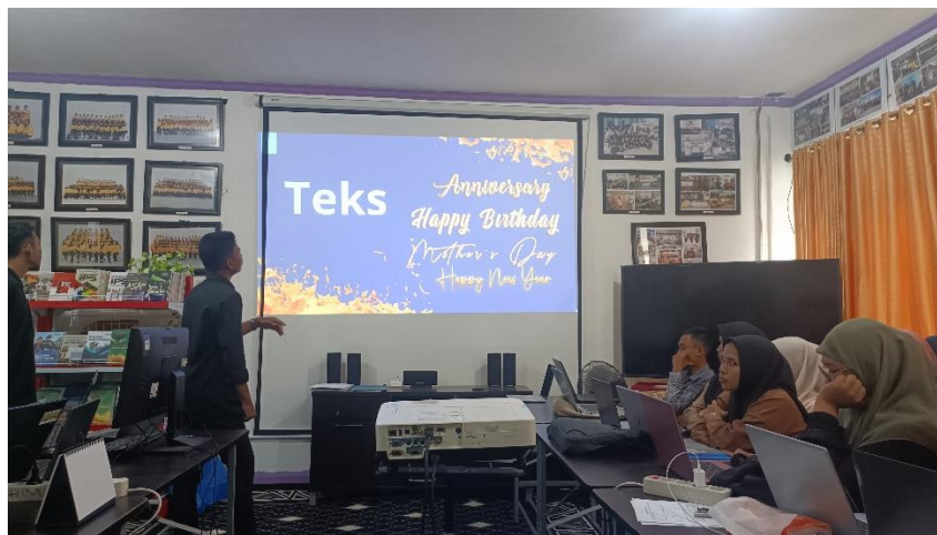
Figure 1. Delivery of material by the instructor