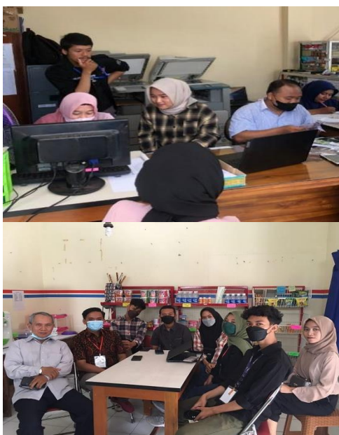
Figure 2 Preparation of Governance BUMDes

The results of the BUMDes governance level found that there needed to be a written organizational structure. As shown above, assistance activities are conducted in preparing the vision, mission, organizational structure, main tasks and functions of the manager, type of business, and capital. These efforts