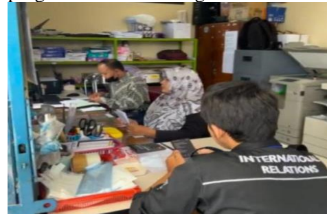
Figure 2 FGD

important role as a representative of the village government in developing local economic potential to provide public services. Therefore, applying digital technology in BUMDes is urgent because it is needed in multiple fields (taxation, finance, and marketing). So, at the FGD implementation stage, there was a discussion about digital marketing strategies that apply e-commerce and upgrade products to survive amidst competitors and reach a wider range of consumers. Then, the FGD on finance is intended to process financial data through software automatically from input of income and expenses, profit and loss balance sheets accompanied by receipts to implement transparency efforts. Followed by a discussion of digital applications in the field of taxation as a body with taxpayer status. The FGD progress is shown in Figure 2.