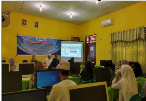
Figure 4 Material presentation by the service team

using Canva with students, or you can also download the module first and then share it with students via WhatsApp group or Google Classroom. The presentation of material by the service team is shown in Figure 4.