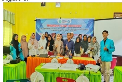
Figure 6 The training closing event

The training closing event is shown in Figure 6.