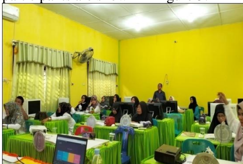
Figure 5 Questions and answers with training participants

After the speaker's presentation, the teachers were eager to ask questions and requested that the speaker repeat the procedures for developing a module using the Canva application so that they could follow them. Regarding the placement of the quiz link in the e-module, one of the teachers inquired about how to create a quiz using other programs. Therefore, based on the needs analysis, this PKM activity can be developed and used by teachers. Questions and answers with training participants are shown in Figure 5.