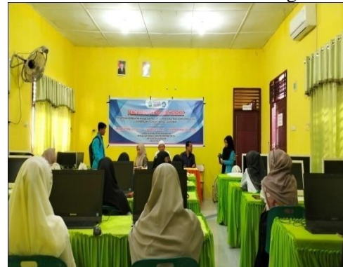
Figure 3 Socialization of service activities

provokes the interest of students to study more actively in class. The socialization of service activities is shown in Figure 3.