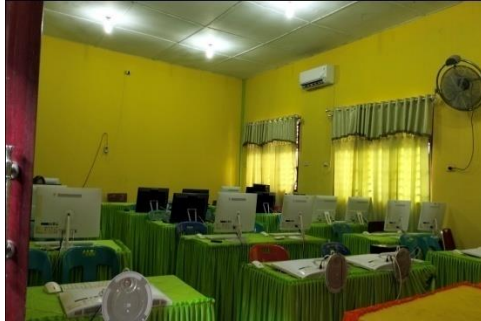
Figure 2 Computer laboratory room

with this, the PKM team immediately saw the computer laboratory room, which already had a capacity of 25 computer units, ready to be used as a training place for doing digital modules for MTsN Seuruway teachers according to the agreed schedule. The computer laboratory room is shown as in Figure 2.