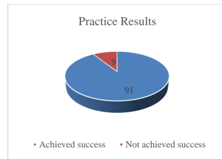
Figure 4 The evaluation outcomes of item analysis utilizing the ANBUSO application

The results of the evaluation of item analysis practice utilizing the ANBUSO Application fall within the category of high success, as illustrated in the Figure 4. The findings indicated that a total of 91% (10 participants) had effectively executed item analysis exercises utilizing the ANBUSO Application, while 9% (1 participant) had not achieved success.