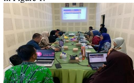
Figure 1 Training process

The strategy for implementing the service commences with service partners gaining an understanding of the underlying theory via training activities. A training session was conducted on September 12, 2023, which covered various topics including theories pertaining to the notion of learning evaluation, methodologies for developing learning evaluations with a specific focus on the autonomous curriculum, test question preparation, and test item analysis. The primary objective of this preliminary activity involving the dissemination of theoretical knowledge is to serve as a means of revitalizing the pedagogical expertise of social studies teachers and to enhance their understanding of learning evaluation protocols and test question preparation. The speaker's material delivery activity is depicted in Figure 1.