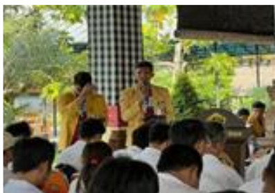
Figure 2 The technical guidance implementation

After the Voting Organizer Group officers entered the technical guidance forum, the service team distributed pre-test forms to measure the knowledge level of Voting Organizer Group members regarding the 2024 election. The pre-test, conducted 10 minutes before the start of the technical guidance activity, involved 20 Voting Organizer Group officers. The pre-test results are shown in Table 1. The technical guidance material presentation began and lasted for 60 minutes, as illustrated in Figure 2.