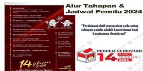
Figure 3 Community service technical guidance material

The material covered during the socialization included an introduction to the general definition, particularly a broad overview of elections. Second, understanding the stages of the 2024 election. Third, there are requirements for being a voter in the election. Fourth, understanding the voter registration procedure. Fifth, knowledge about the ballot papers. Sixth, we need to understand the election laws in Indonesia. With an understanding of these six topics, Voting Organizer Group officers are expected to perform their duties efficiently, provide accurate guidance to voters, ensure a smooth election process, and comply with applicable legal regulations, thus supporting the creation of fair, transparent, and accountable elections. An example of the technical guidance material can be seen in Figure 3.