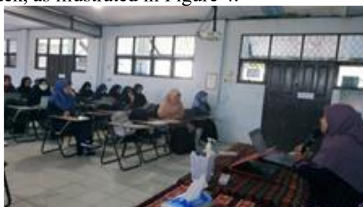
Figure 4 Material explanation about research grant proposal writing

Lecturers at UMB have significant opportunities and possibilities to complete the novice lecturer research grant scheme (NLR) in accordance with the current schemes. A few lecturers expressed interest in attempting to submit a proposal. Participants enthusiastically engaged in the discussion session and inquired about the process of uploading proposals to BIMA Kemendikbudristek, as illustrated in Figure 4.