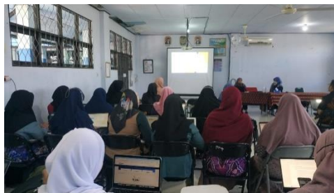
Figure 5 Question-and-answer session

The speakers also offered strategies for securing the grant, including the creation of a concise and captivating title, the adherence to the available format or template in the proposal, and the inclusion of mandatory outcomes in the form of Sinta-indexed journal articles (preferably between 1-4) or Scopus-indexed journals. The speaker also underscored the importance of adhering to the limit established by the Directorate General of Higher Education, Research, and Technology (DGHERT) concerning the number of proposal characters. The writer should read an example of a model proposal that has already received NLR grant funding and have the proposal reviewed by peers who have experience passing routine NLR grants before sending it. Additionally, several other critical factors must be taken into account. This activity is illustrated in Figure 5.