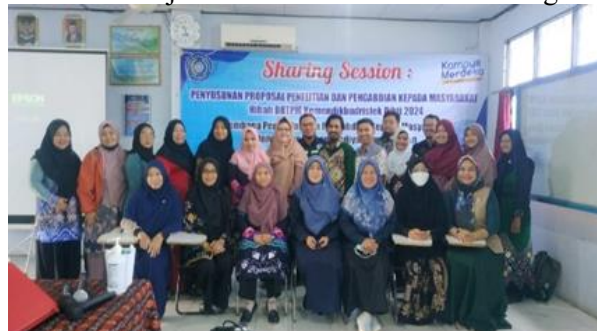
Figure 6 Photos with participants

During the second session, participants were provided with strategies and advice for obtaining community service grants. The community service grant scheme has been effectively completed by only one individual at UMB thus far, as the selection process is more rigorous than that of the novice lecturer grant. Lecturers who had previously received community service grants delivered the material directly. The speaker underscored the importance of community service activities' outcomes through community service journal articles that Scopus or Sinta indexes. The higher the index of the intended journal is, the better the quality of the outputs is. Two lecturers were successfully accepted to publish their articles in Sinta 4-indexed journals due to the article writing assistance.