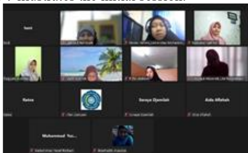
Figure 7 Online assistance

activity was conducted twice, specifically in April and August. The initial activity involved training on selecting indexed journals, examining writing formats, submitting procedures, and reviewing in OJS if revisions are required. Various writing strategies are required to enhance the quality of scientific articles (Sudirman et al., 2023). The second stage of the online session provided a more comprehensive discussion of the strategies for writing scientific journals. Figure 7 illustrates the initial session.