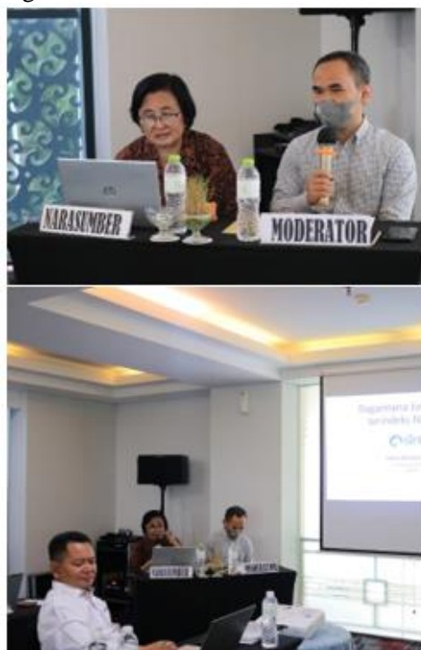
Figure 2 Documentation in the Seminar

Wednesday, 8 March 2023 can be seen in Figure 2.