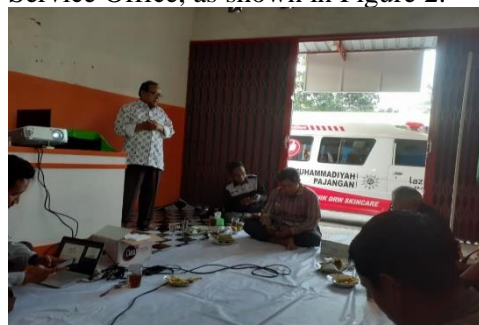
Figure 2 Administrative management training by the head of the LazisMu regional service office in bantul

of the LazisMu Regional Service Office in Bantul, held at the LazisMu Pajangan Service Office, as shown in Figure 2.