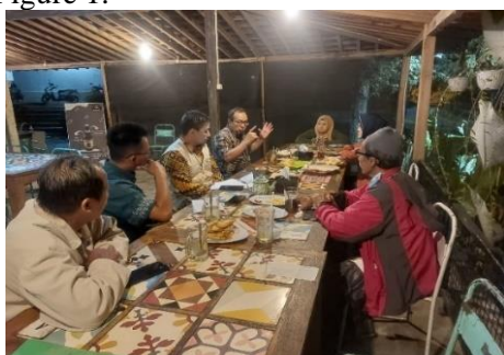
Figure 1 FGD with the head of the LazisMu regional service office in bantul