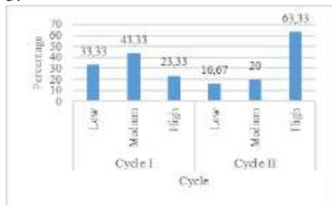
Figure 3 Comparison of students' learning motivation

and cycle II can be seen in the figure 3.