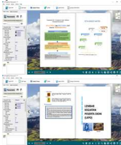
Figure 1 Electronic student worksheets with the PjBL

The following is Figure 1 of the electronic student worksheets with the PjBL.