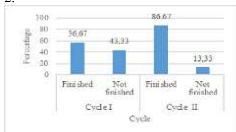
Figure 2 Comparison of learning outcomes

After improving learning in cycle I and cycle II, the results of reflection in cycle I are then implemented in cycle II. The comparison of the learning outcomes of class VII-E SMP Negeri 14 Banjarmasin students who were carried out in online learning during the Covid-19 pandemic can be seen in the figure 2.